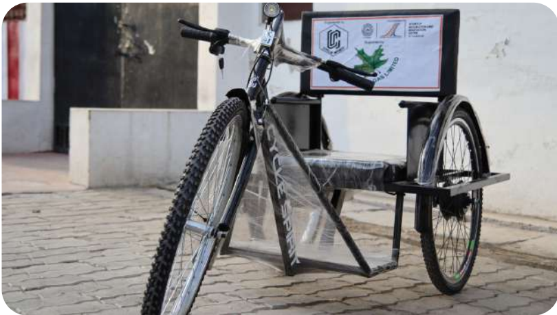
Semi-automatic battery-powered Electric Tricycle, developed by Cycle Spirit

It is a remarkable achievement for both the young innovators. At such a tender age, the innovators delivered quality, assured products that were designed with perfection in a stipulated time period.